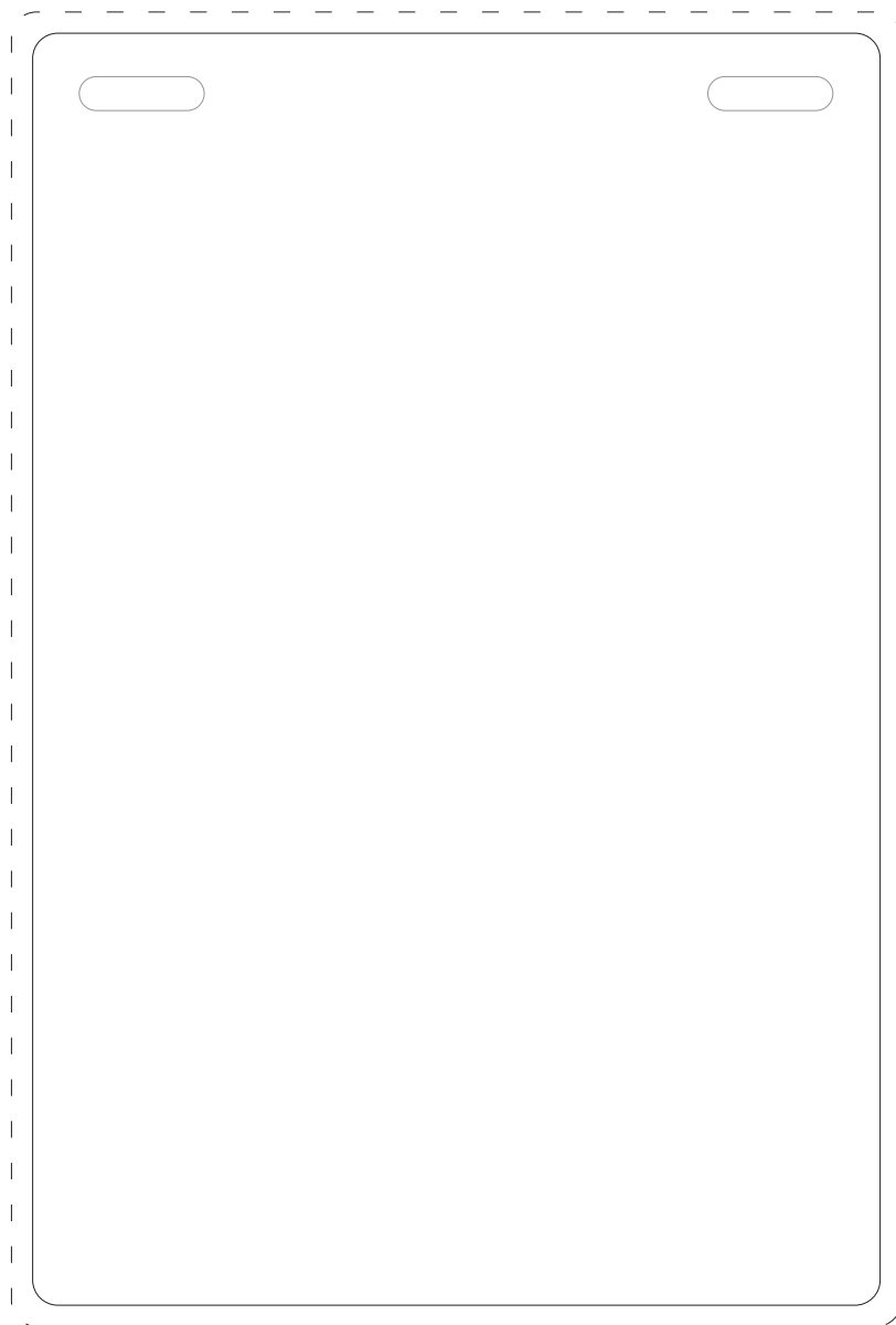
4 x 6 " Artwork 4,2 x 6,2 "