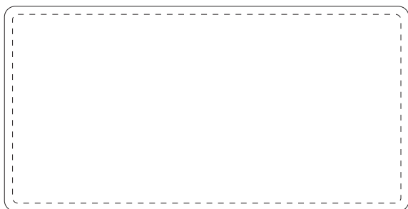
Badge size 2.95" x 1.5" / 75 x 38 mm Printable area 2.84" x 1.38" / 72 x 35 mm

Please provide your artwork in vectorized PDF format and CMYK colors with outlined texts. If you are ordering chalkboard name tags with preprinted names, supply us with your font files and an excel sheet of individual names. Do not supply artwork with names as personalization is done during the printing stage.