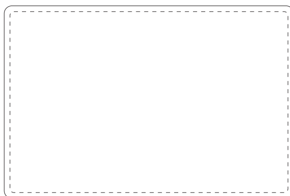
Badge size 2.95" x 2" / 75 x 50 mm Printable area 2.84" x 1.85" / 72 x 47 mm